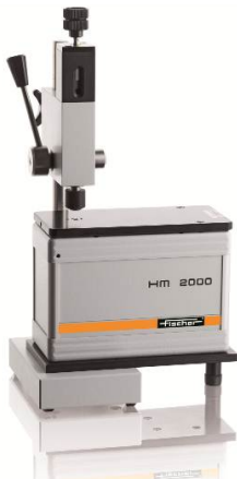
Fig. 1: FISCHERSCOPE® HM2000 S for the determination of the Martens Hardness

Determining the 'pencil hardness' – or better put, the scratch resistance by means of marking with pencils – according to Wolff Wilborn or DIN ISO 15184 is a method commonly used in the coating industry. With this method, pencils of different hardnesses are moved at a certain angle and with a certain force across the paint surface to be tested. The 'pencil hardness' of the coating is defined by two consecutive levels of pencil hardness, where the softer one leaves only a writing track, while the harder one actually causes a tangible deformation of the paint coating.